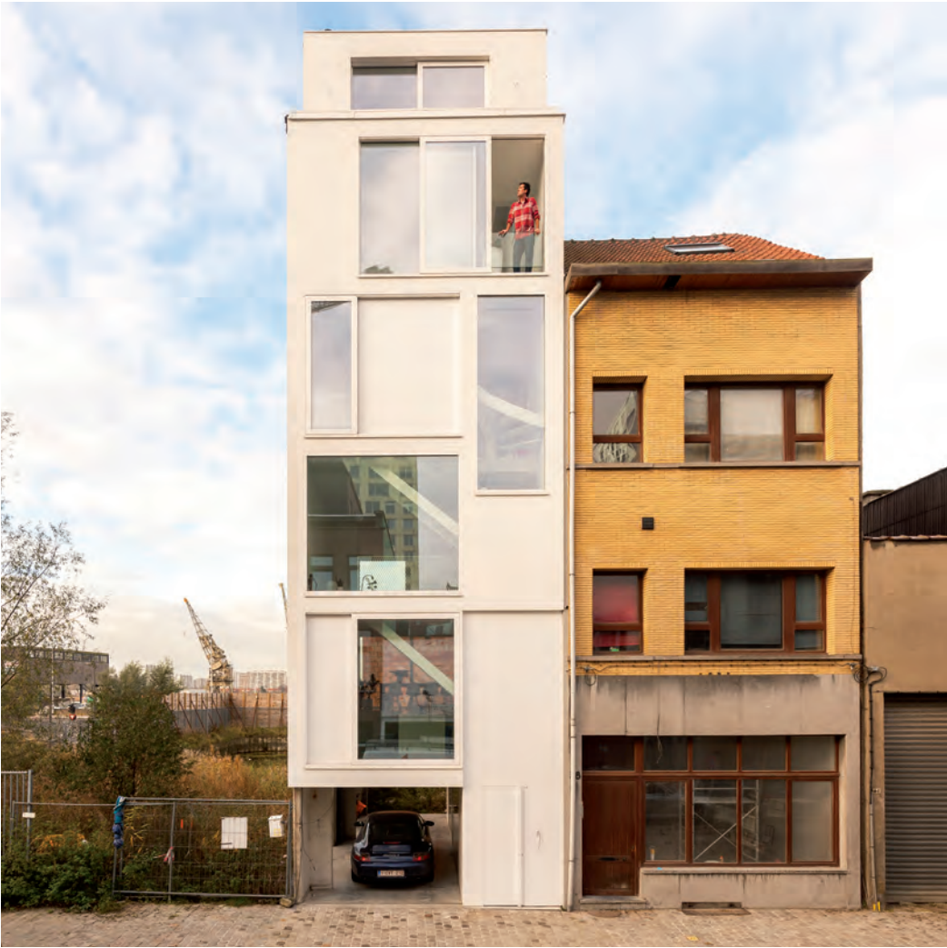
← | Front façade ↓ | Third, fourth and fifth floor plans