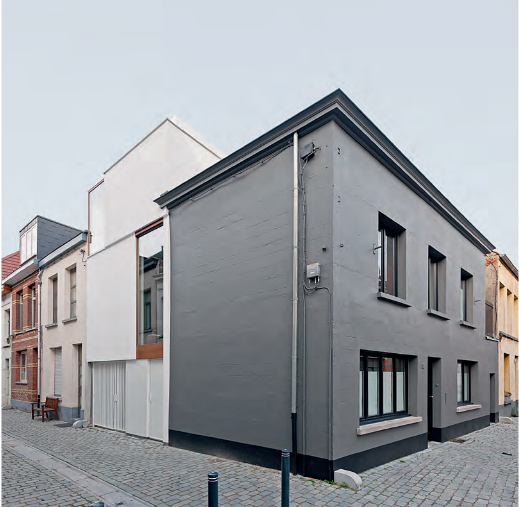
↑ | Ground, first and second floor plans ← | Exterior, street view