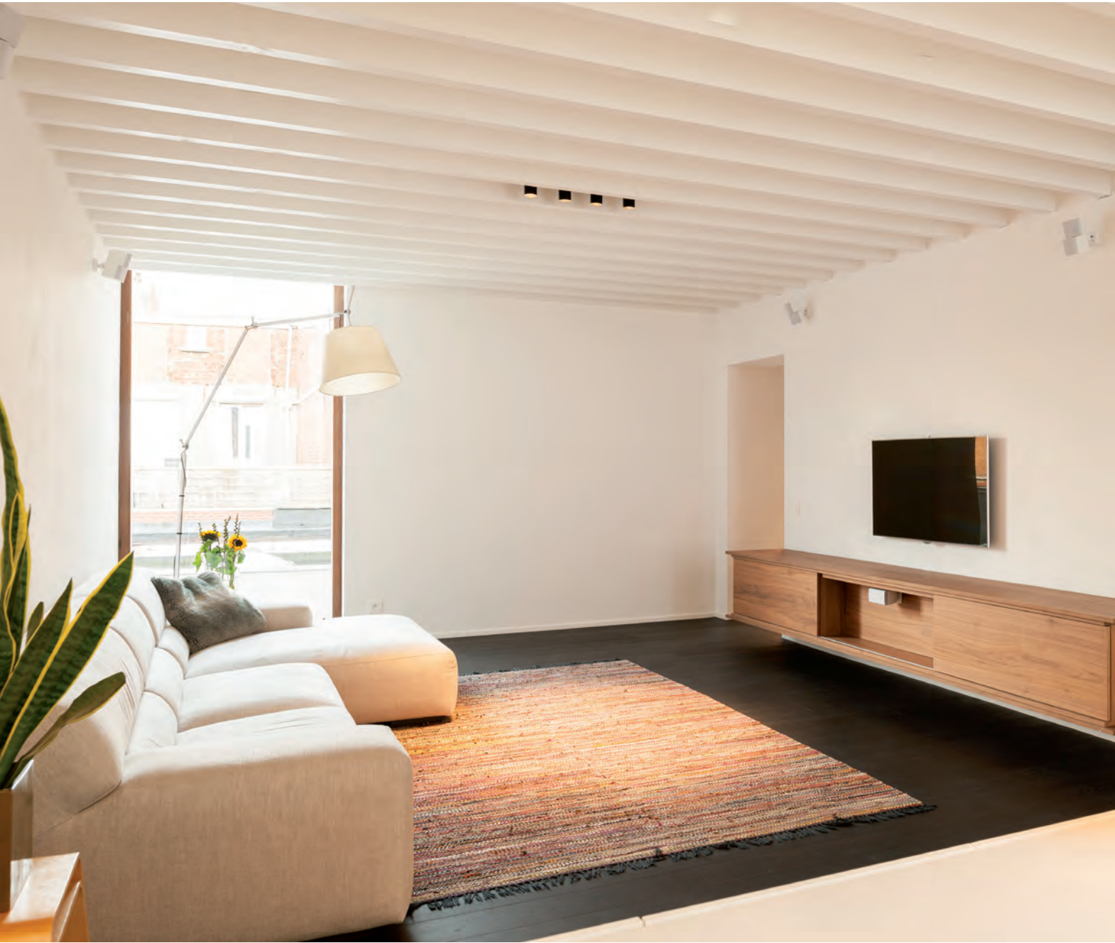
↑ | Living area → | Windows, swimming pool in background

Address: Lookstraat, 2500 Lier, Belgium. Client: Peter Claes, Sophie D'Hulst. Completion: 2012. Gross floor area: 250 m 2 . Planning partners: David D'Hulst, Kalle Block. Number of rooms: 8. Main materials: masonry, concrete, wood. Situation: part of existing development in urban context.