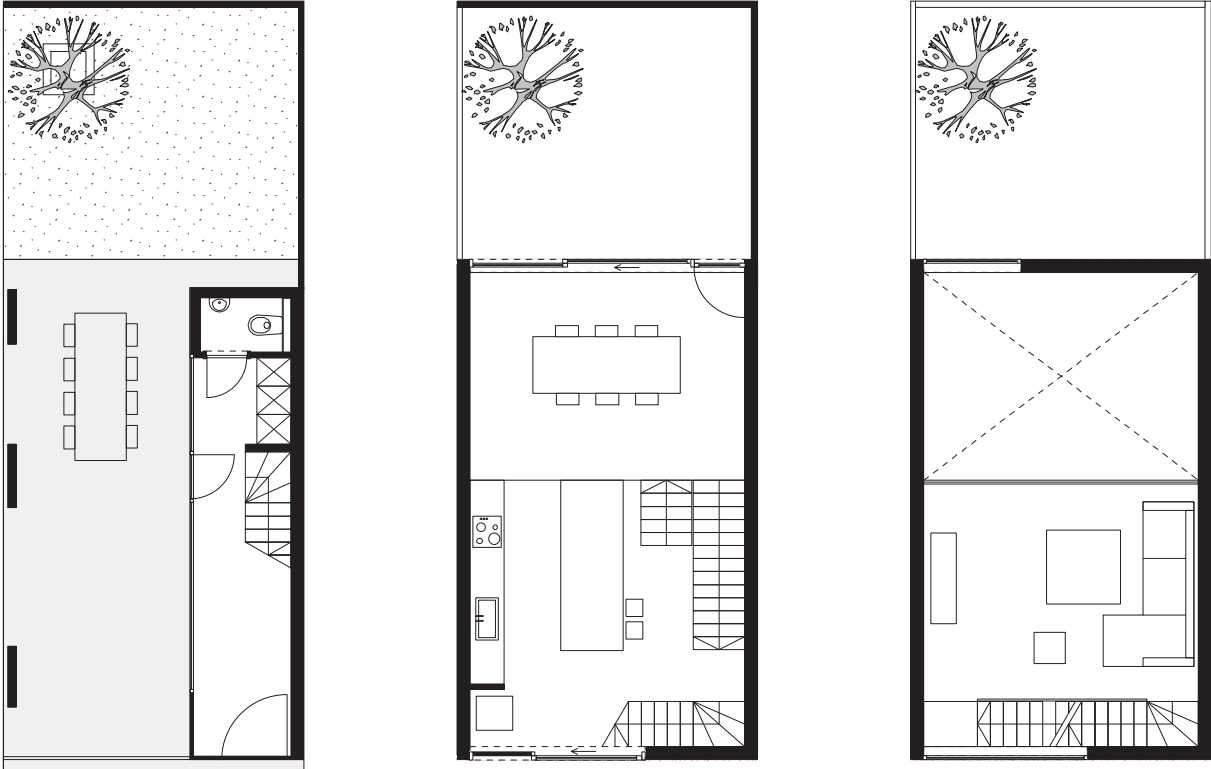
↑ | Ground, first and second floor plans ← | Living area, view towards façade