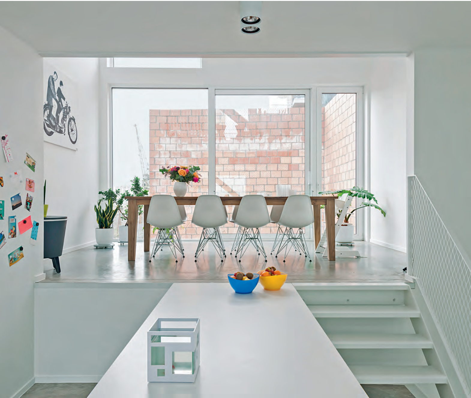
↑ | Dining area → | Split level, first and second floor

Address: Braziliestraat, 2000 Antwerp, Belgium. Client: Hansi Ombregt, Sophie Janssens. Completion: 2012. Gross floor area: 200 m 2 . Number of rooms: 9. Main materials: aluminum, polished concrete, steel. Situation: semi-detached building in urban context.